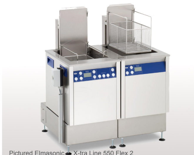
Pictured Elmasonic X-tra Line 550 Flex 2

Modular cleaning line consisting of ultrasonic cleaning unit plus rinsing unit, available in 5 different unit sizes (300, 550, 800, 1200 and 1600). There are two different models for each size: multi-frequency 25/45 kHz (MF2) or 37/130 kHz (MF3). Available rinsing tank models (S): with heating (H) or without heating. The oscillation device for the cleaning basket assists and improves the cleaning and rinsing effect and also provides a drip-off support for the stainless-steel basket (EKO). The cleaning line can be fitted with a hot air dryer (WLT) of the relevant size. The units are delivered including support frame.