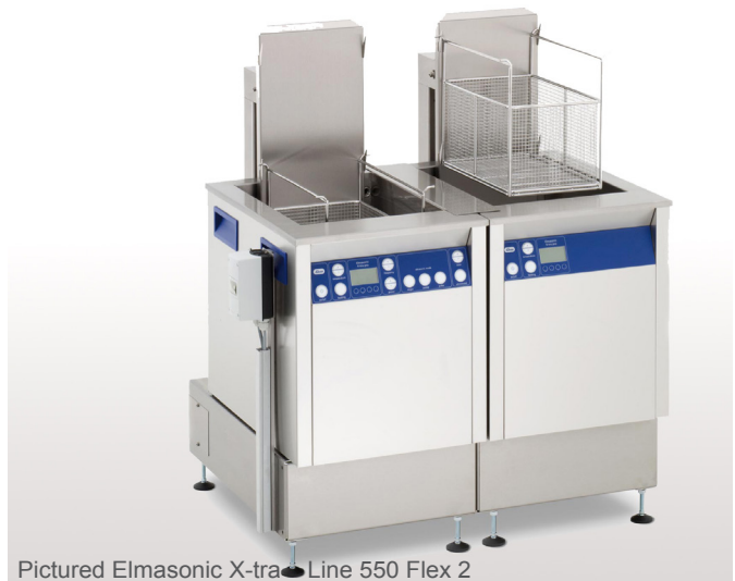
Pictured Elmasonic X-tra Line 550 Flex 2

Modular cleaning line consisting of ultrasonic cleaning unit plus rinsing unit, available in 5 different unit sizes (300, 550, 800, 1200 and 1600). There are two different models for each size: multi-frequency 25/45 kHz (MF2) or 37/130 kHz (MF3). Available rinsing tank models (S): with heating (H) or without heating. The oscillation device for the cleaning basket assists and improves the cleaning and rinsing effect and also provides a drip-off support for the stainless-steel basket (EKO). The cleaning line can be fitted with a hot air dryer (WLT) of the relevant size. The units are delivered including support frame.