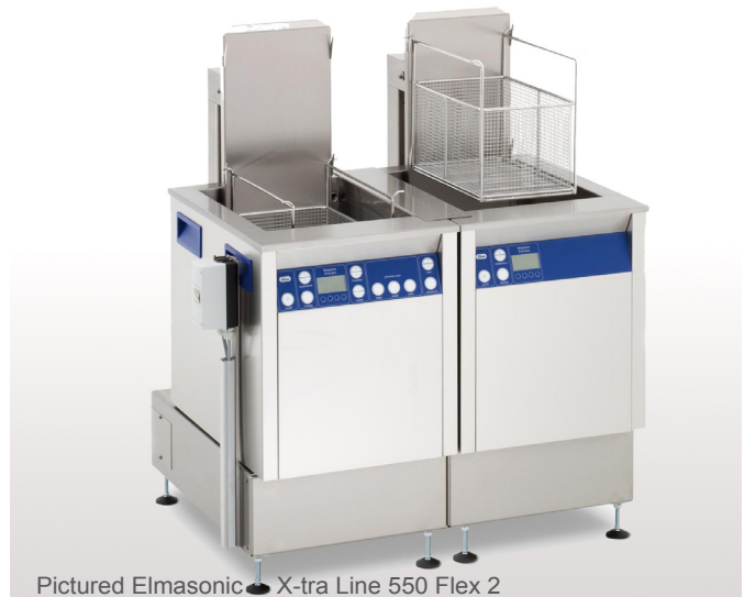
Pictured Elmasonic X-tra Line 550 Flex 2

Modular cleaning line consisting of ultrasonic cleaning unit plus rinsing unit, available in 5 different unit sizes (300, 550, 800, 1200 and 1600). There are two different models for each size: multi-frequency 25/45 kHz (MF2) or 37/130 kHz (MF3). Available rinsing tank models (S): with heating (H) or without heating. The oscillation device for the cleaning basket assists and improves the cleaning and rinsing effect and also provides a drip-off support for the stainless-steel basket (EKO). The cleaning line can be fitted with a hot air dryer (WLT) of the relevant size. The units are delivered including support frame.