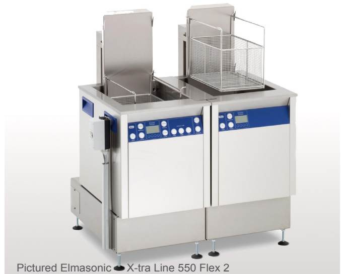
Pictured Elmasonic X-tra Line 550 Flex 2

Modular cleaning line consisting of ultrasonic cleaning unit plus rinsing unit, available in 5 different unit sizes (300, 550, 800, 1200 and 1600). There are two different models for each size: multi-frequency 25/45 kHz (MF2) or 37/130 kHz (MF3). Available rinsing tank models (S): with heating (H) or without heating. The oscillation device for the cleaning basket assists and improves the cleaning and rinsing effect and also provides a drip-off support for the stainless-steel basket (EKO). The cleaning line can be fitted with a hot air dryer (WLT) of the relevant size. The units are delivered including support frame.