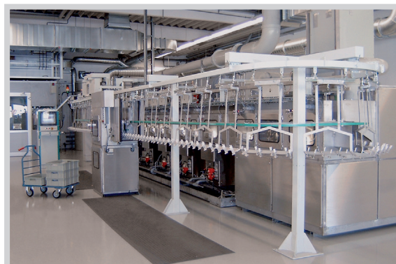
Pass-through spray facility with suspension conveyor