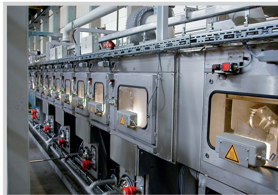
Close-up of pass-through spray facility

Bath conditioning is effected as required using filters for particle separation, oil separators to protect the cleaning blades and evaporators or complete demineralisation recirculation facilities as part of rinsing bath care.