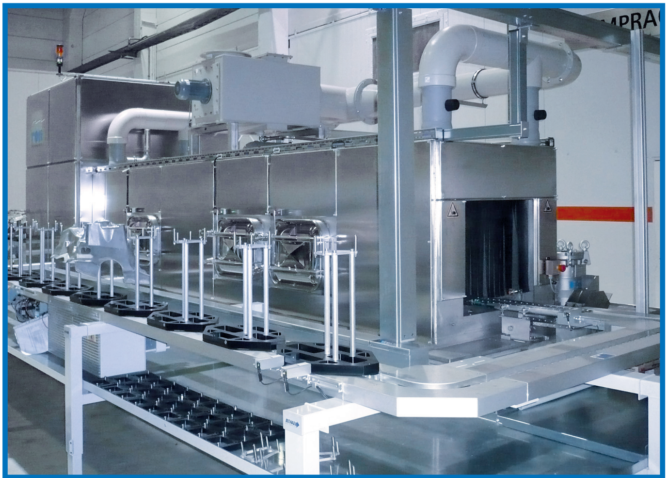
Pass-through spray facility with part transport device