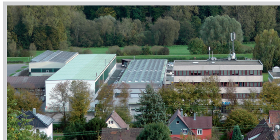
Our factory premises in the valley of the Enz Valley

Cleaning and degreasing facilities for aqueous media, halogenated and nonhalogenated solvents.