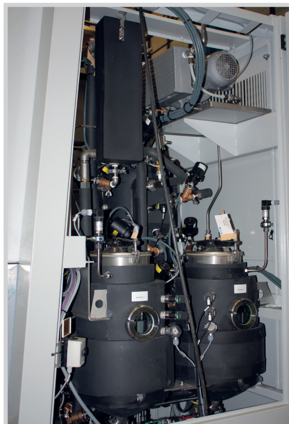
Interior of „petite“

Cleaning and degreasing facilities for aqueous media, halogenated and nonhalogenated solvents.