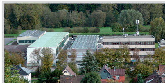
Our factory premises in the Enz Valley