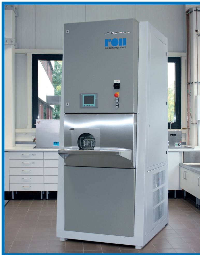
Cleaning facility „petite“ for standard applications